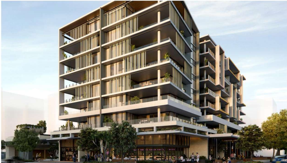
VISION: Artist's impressions of the new Seanna Residences.