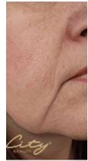
How To Get A... (Effortless)

While the first sods for the Seanna project were turned on Wednesday, work has also ramped up on the neighbouring Oceanus site.