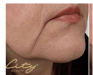
How To Get A Sculpter (Effortless DI)