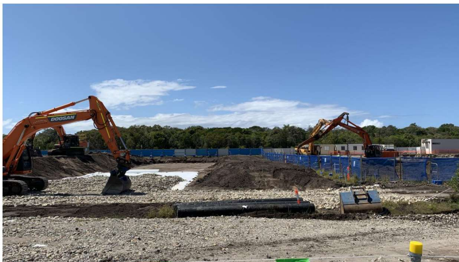
UNDERWAY: The Seanna Residences at Bokarina Beach are underway and work has ramped up on the Walter Iezzi site next door.

"We've all adapted to living in COVID situation now, it's the new normal, and we're progressing and it is good."