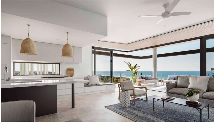
VISION: Artist's impressions of the new Seanna Residences.

"It'll (Seanna construction) go quite quickly, we'll be finished December next year all going well."