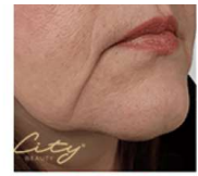
How To Get A Sculpture (Effortless D

He said the whole community had seen the journey the project had taken.