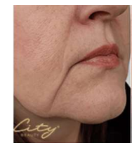
How To Get A Sculpter (Effortless D