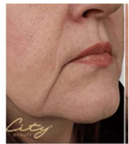
How To Get A Sculpture (Effortless DI

Trio charged with violent robbery at C home