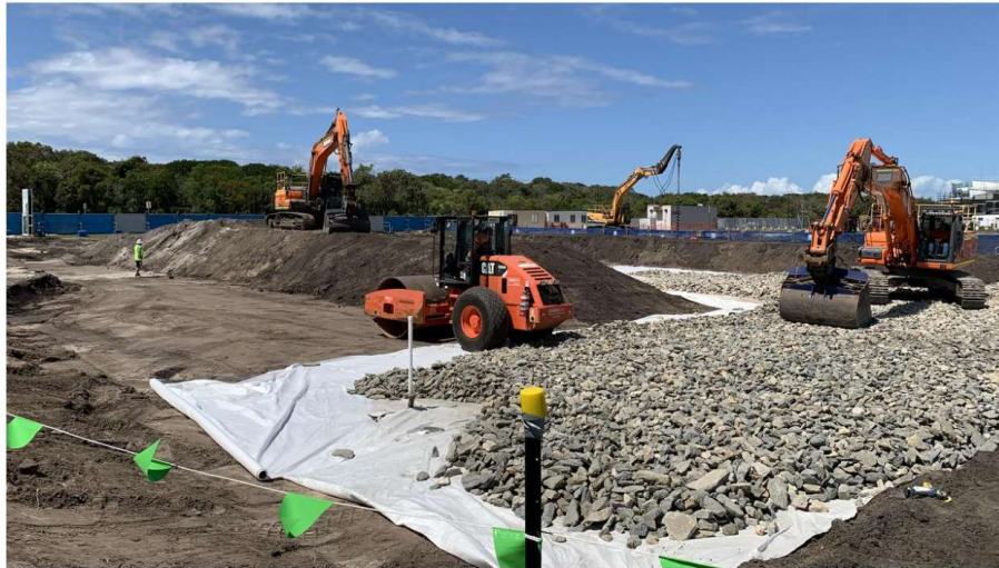
UNDERWAY: The Seanna Residences at Bokarina Beach are underway.