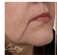
How To Get A Sculpter (Effortless D

He said he tipped the neighbouring residential developments under construction to be complementary of each other, and the market had indicated that to-date.